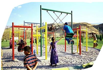
KaBOOM! Creates Safe Play spaces to Scale

But even with my share of bangers and mash from the "Big Bang" (my favorite pub) I was troubled. It was not because I somehow